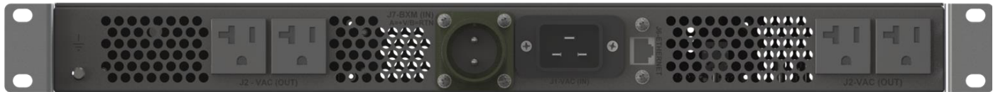
PG1500-UPS-4N Front View

Ground Stud Air Exhaust AC Output BXM Input AC Input Ethernet Port Air Exhaust AC Output