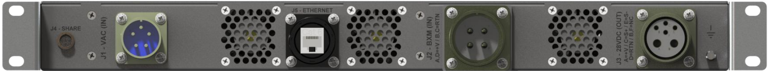
PG1500-UPS-DC28-3P Rear View